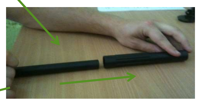
2) The two poles need to be pushed together as above.